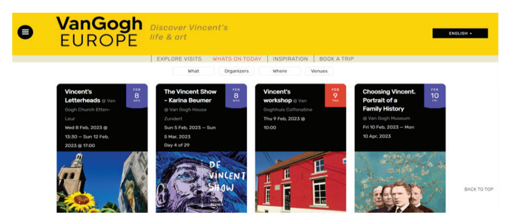
The new calendar on the website.

Due to the rebranding of Van Gogh Europe, it was also time to revise the website. The objective was to connect the look and feel of the new logo and branding with our website. In particular, we wanted to make some changes to the menu and layout as well as updating all of our information. Of course, all partners also needed to be included on the partners' page. A special page also needed to be created for the Van Gogh trips.