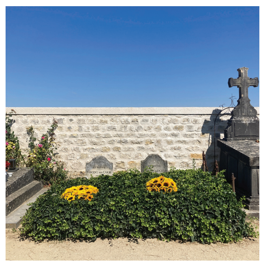
The graves of Vincent and Theo van Gogh in Auvers-sur-Oise on 29 July 2022.