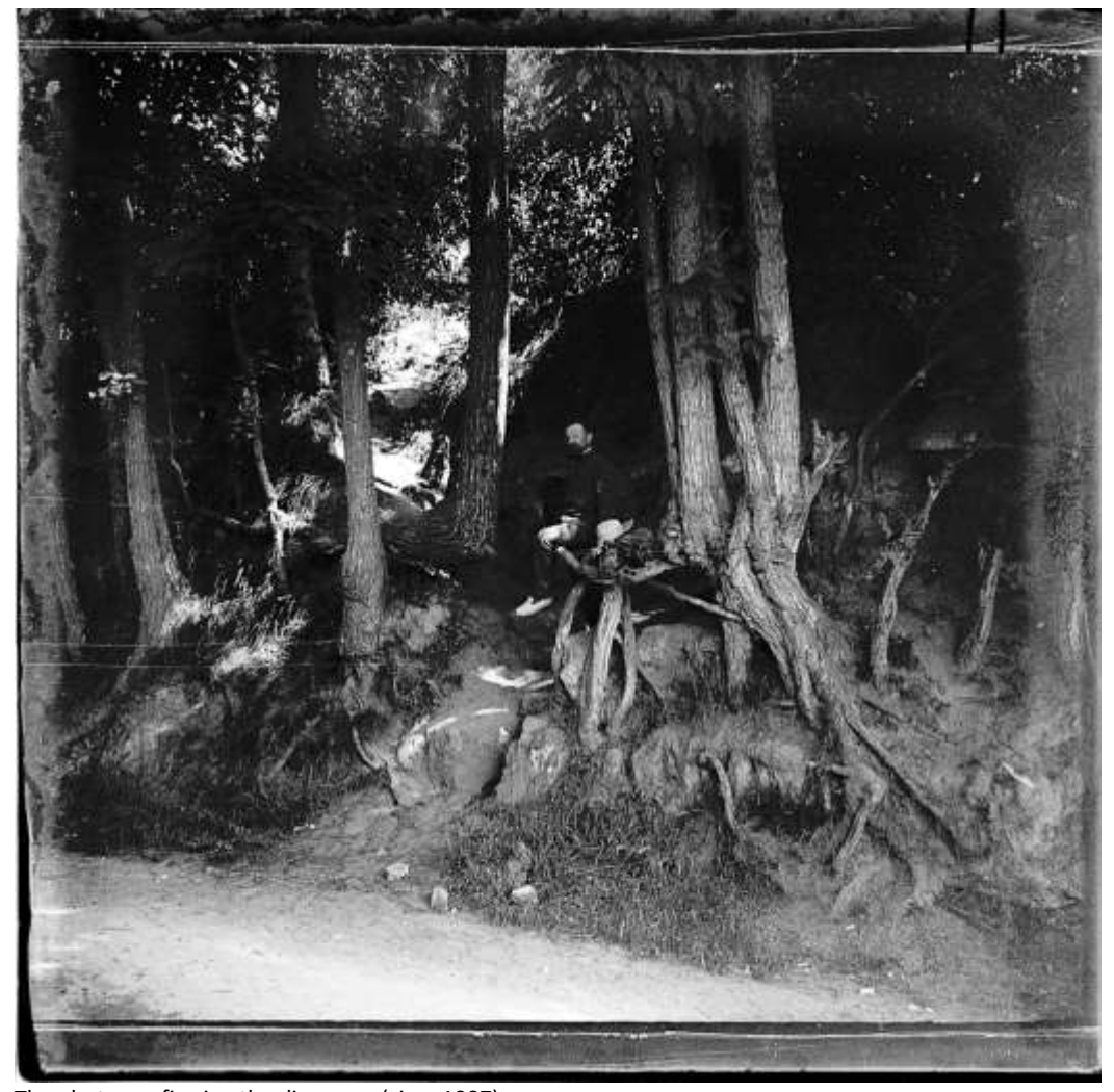
The photo confirming the discovery (circa 1907)